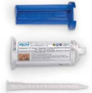
7 Kit compound with blue plunger (code 204 0000 200)