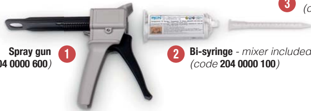
1 Spray gun (code 204 0000 600)